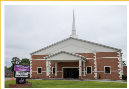
Unionville Missionary Baptist Church 3837 Houston Avenue Macon, GA 31206

Having these teams readily available in the community will enable more children to be exposed to our R.I.S.E. and other Initiatives and will allow our victim services staff to work more closely and effectively with crime victims in their own neighborhoods.