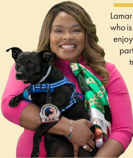
Right: Lamar at work!

Lamar is our Office's veteran certified emotional support animal, who is available to assist with victim interactions and who especially enjoys working with our child victims. With our youngest victims, in particular, Lamar's attentiveness and sensitivity, help to ease the trauma of the necessary courtroom appearances to make sure their voices are heard and their stories are told.