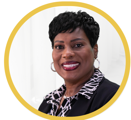
DIRECTOR OF VICTIM SERVICES