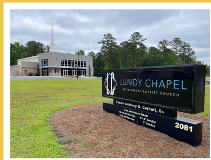
Lundy Chapel Missionary Baptist Church 2081 Forest Hill Road Macon, GA 31210